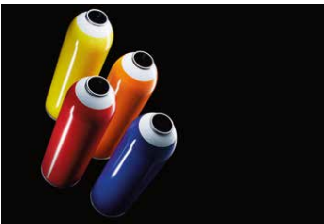
Protact for aerosols

One longstanding application for Protact is in the general line area which includes paint cans. Protact can be used here to produce components such as lids and rings. Protact’s flexible coating makes strong deformation possible whilst still offering good pack performance with water-based paint systems.