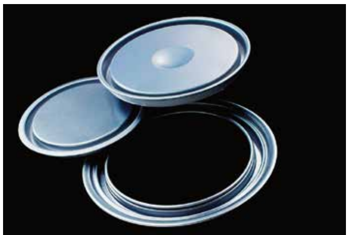
Protact for general line