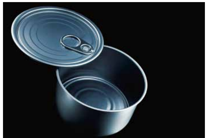
Protact for fish cans

Protact is also available for aerosol can manufacture. It offers a number of benefits over lacquered ends for components such as tops and bottoms. One benefit is the elimination of orange rust rings in humid environments such as bathrooms. More brittle lacquers tend to be susceptible to corrosion from liquids including shaving foam. Protact has a more flexible coating which means that end corrosion is eliminated. The 2-piece aerosol container has been a huge success in the market. For aerosol can manufacturers, Protact allows for production optimization and improved product performance, in the same way as it does for 2-piece D&I food cans. This makes for a significantly more