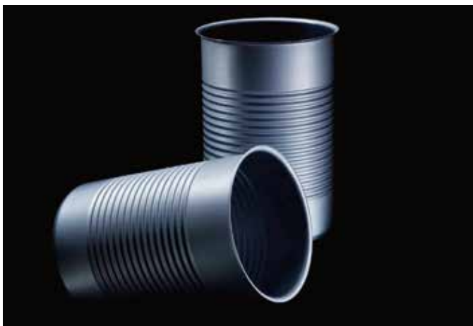
Protact for food cans

Use of Protact for 2-piece D&I canmaking eliminates the need for operations related to lacquering. This enables a reduction in associated manning and maintenance. It also eliminates emission of VOCs in the canmaking process and significantly reduces energy consumption. Use of Protact also provides scope for reduced water consumption. To deliver further gains, Tata Steel is developing Protact laminated steel to full D&I width for optimised can line output.