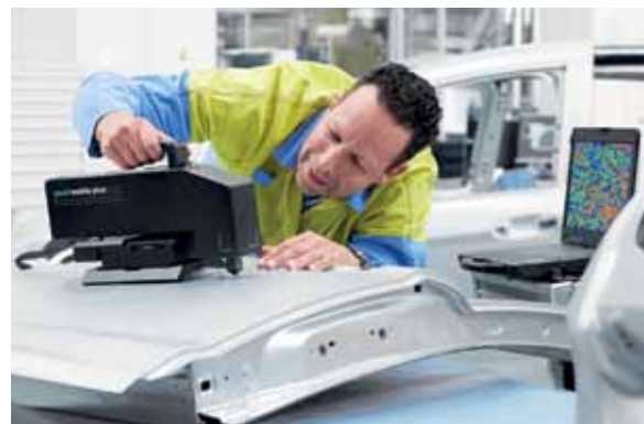
Roughness measuring of parts to indicate galling

A high level of tool pollution is often evident where high friction occurs during processing. There are two types of tool pollution: adhesive sheet wear and abrasive sheet wear. The former refers to the adhesive transfer of zinc particles, which causes galling, while the latter is the scraping off of zinc particles. Galling results in scratches on the surface of the steel, and the removal of zinc particles causes pimple defects, both affecting the appearance of the component after painting.