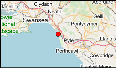
ES Figure 6.5

Brunel House 2 Fitzalan Road Cardiff CF24 0EB