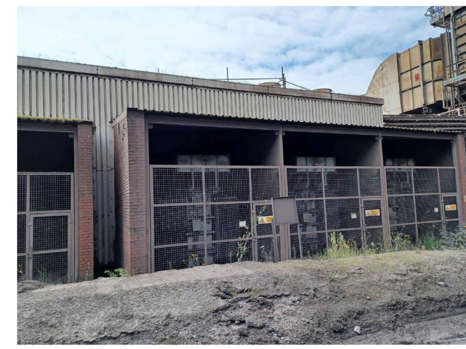
Photo 3 - Existing Compressor House With MCC Room