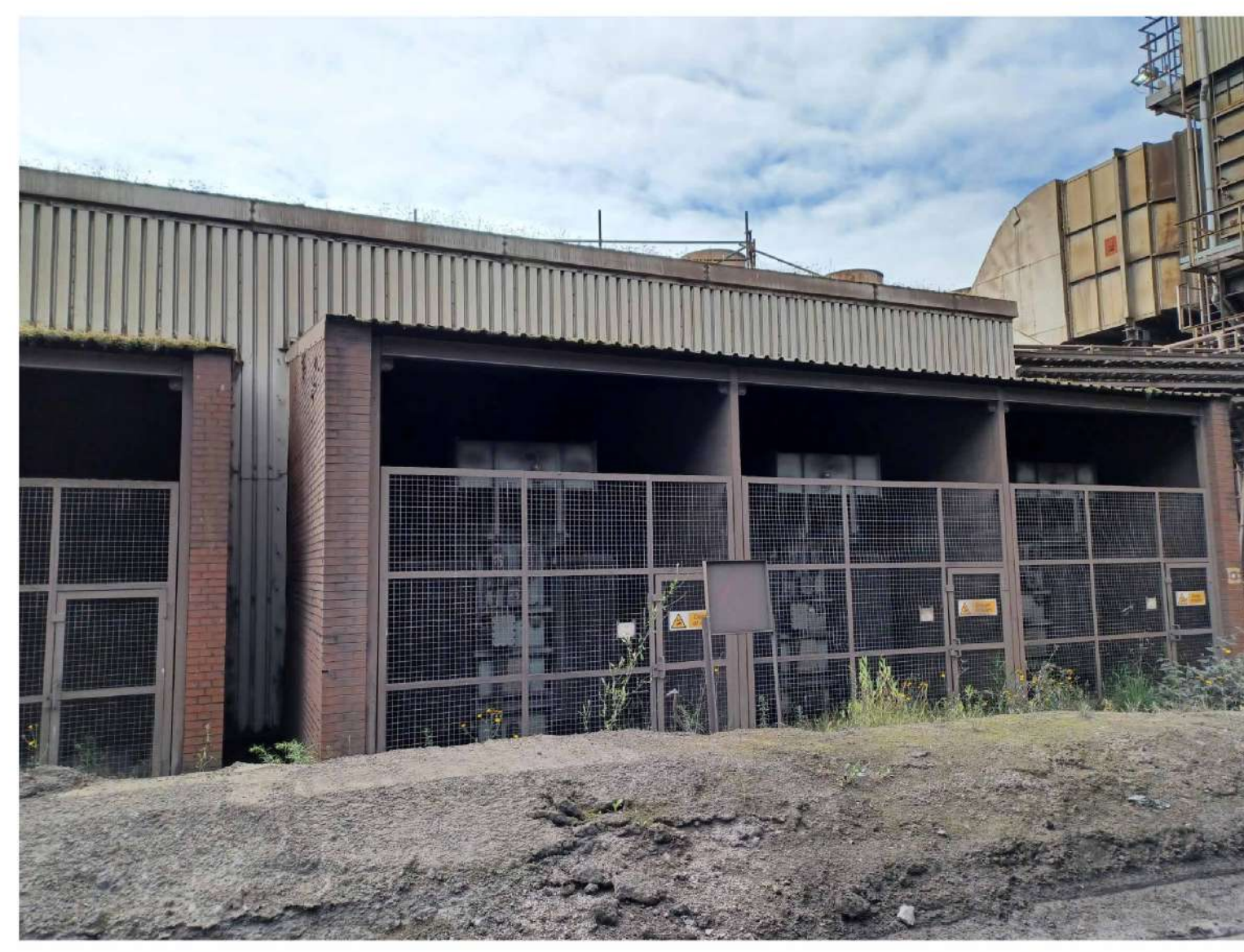
Photo 1 - Existing Compressor House With MCC Room

DO NOT SCALE Any discrepancy or query concerning this drawing should be referred to the Architect. Registered Office: Greenmeadow Springs, 1 Cae Gwyddel, Torgynfa, Cardiff CF15 7AB Reg. Co. No. 272417E, VAT Reg. No. 154 2146 06