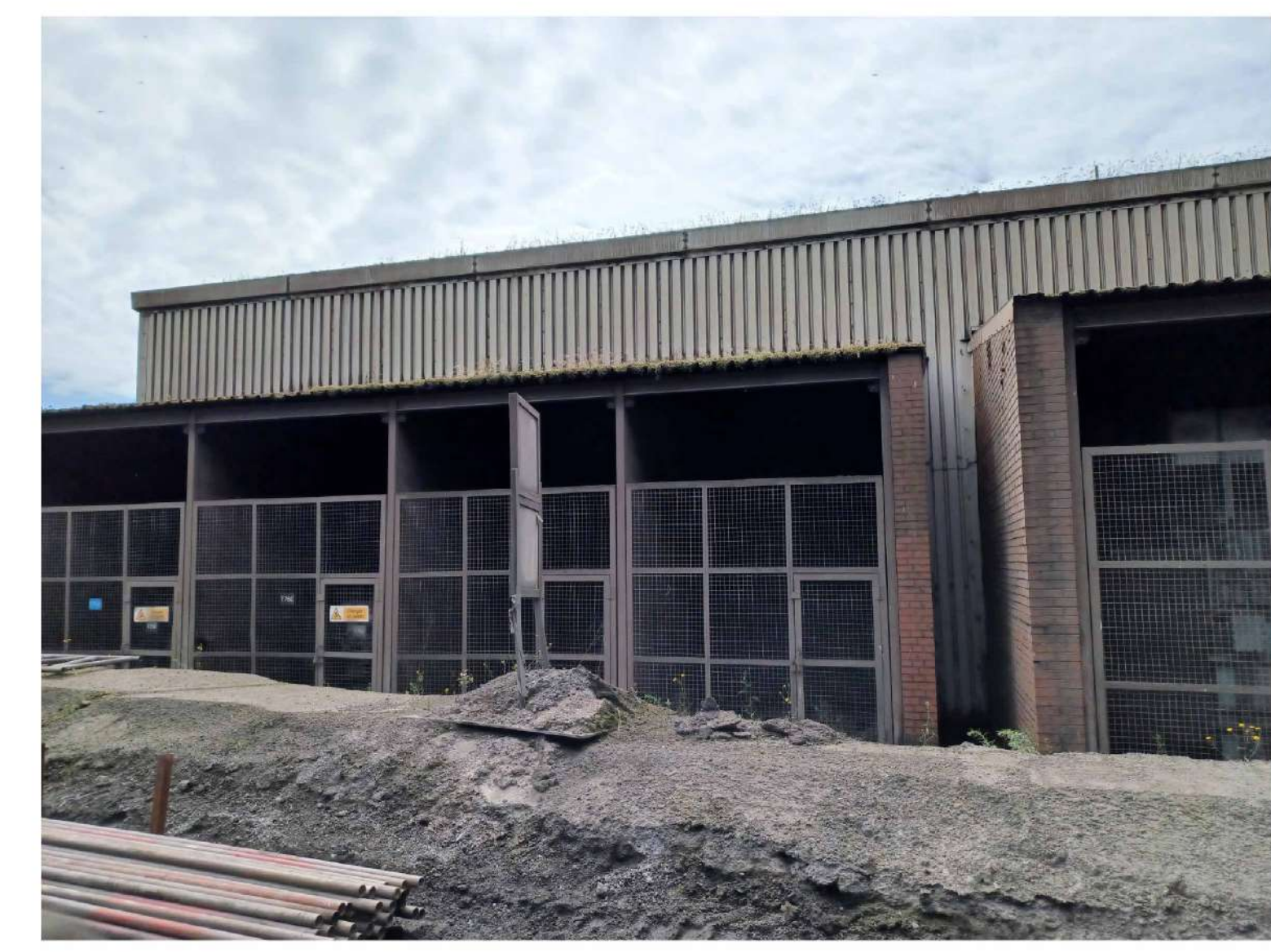
Photo 2 - Existing Compressor House With MCC Room