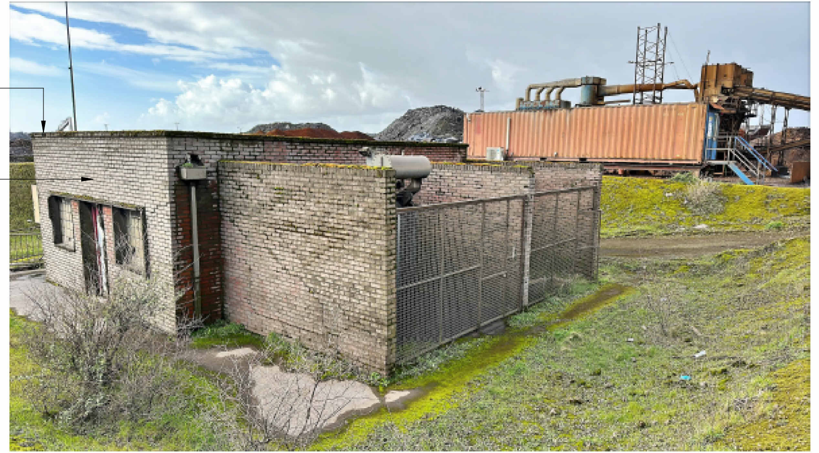
Photo 2 - Harsco Frag Plant