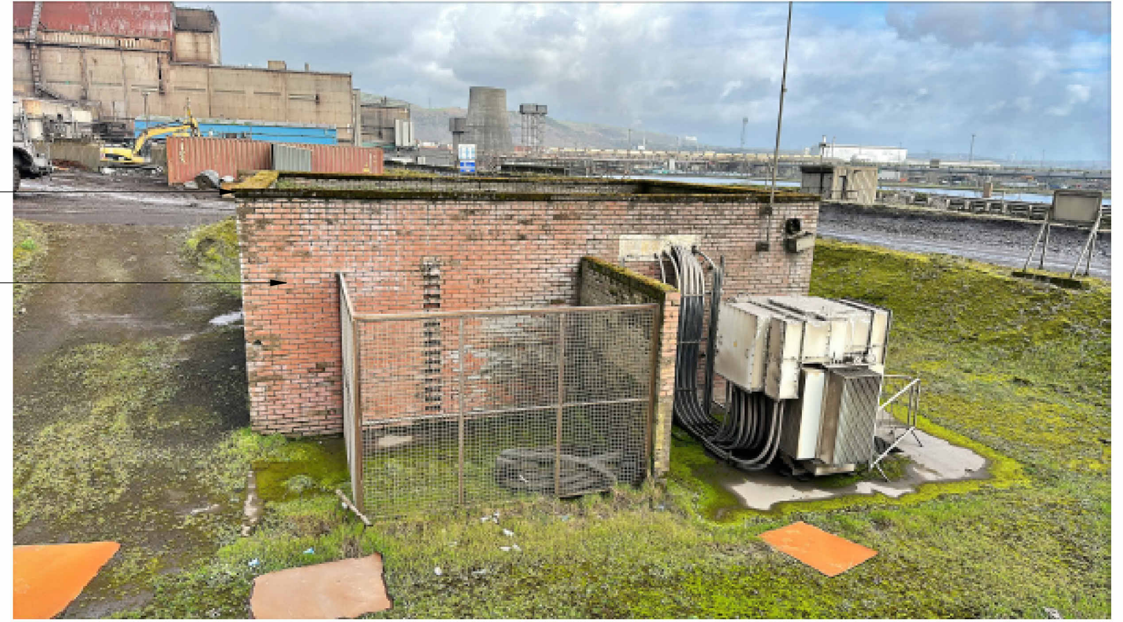
Photo 1 - Harsco Frag Plant