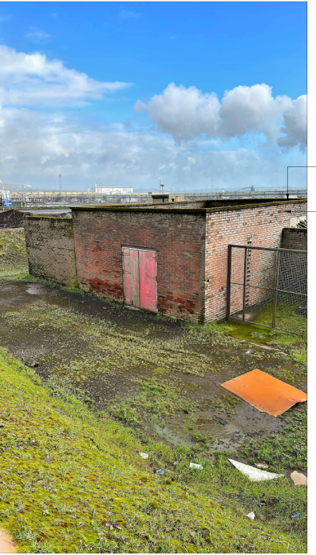
Photo 3 - Harsco Frag Plant