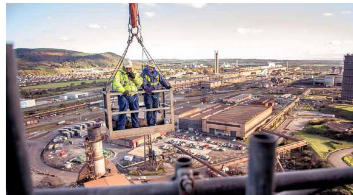
The project has seen our workforce and contractor partners go above and beyond

and provide a smoother profile to aid the descent of the raw materials.