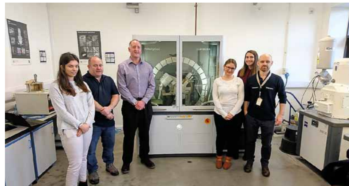
The XRD will support process improvements, aid with new product development and help the business bring more testing in-house