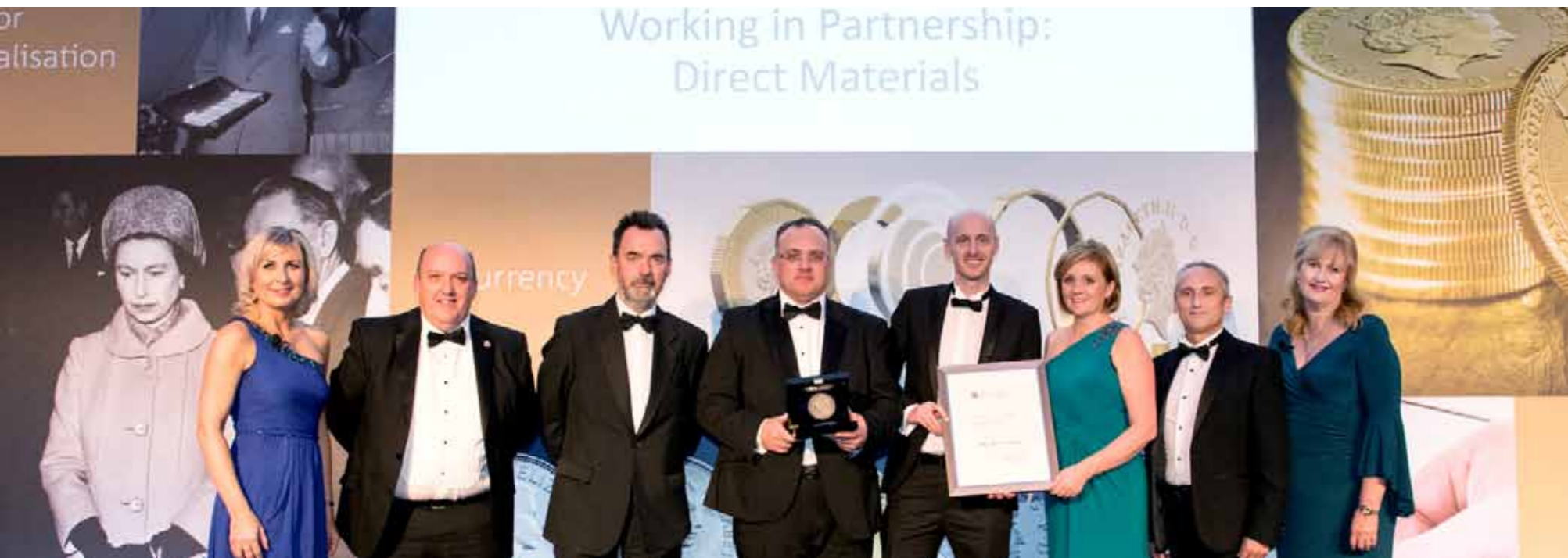
It's smiles all round as Tata Steel bags another supplier award