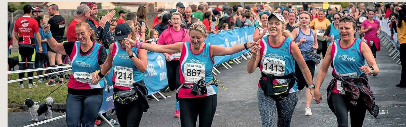
Many ran in teams, sharing in the glory and elation crossing the finish line together

Representatives from groups including the Port Talbot YMCA, Scouts, Cwmafan and Ponrhydyfen RFC and