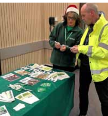
Macmillan coffee morning was also an opportunity for employees to get some advice