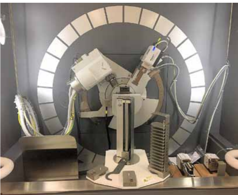
The X-Ray Diffraction (XRD) spectrometer recently commissioned at the Harbourside labs