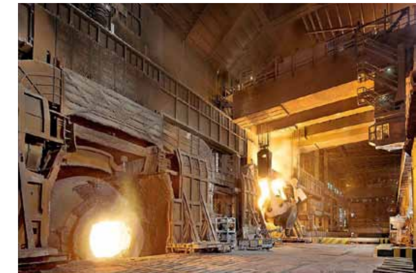
The North Charging crane in action, but getting ready for a well-deserved retirement

Now, with the third crane in the pipeline, plans are being made to complete the specifying and tender process for the Teeming Crane.