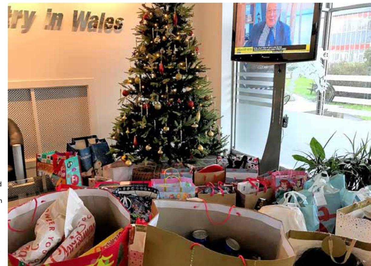
Gifts bought with generous donations from staff at the steelworks