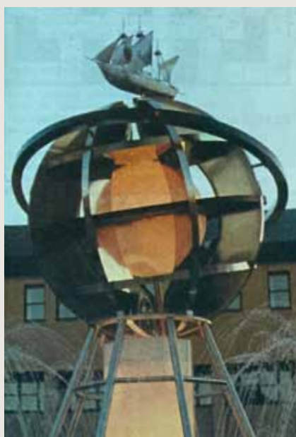
October 1989 saw the official opening of the Princess Royal Theatre in Port Talbot by Princess Anne. She was also on hand to unveil a sculpture and fountain at the front of the building. The sculpture had been manufactured on site at the central engineering workshops.

If you have any pictures of memories to share, please get in touch with us – use the hashtag #porttalbotsteelmemoires across social media or drop us an email community.committee@tatasteelurope.com we would love to hear from you