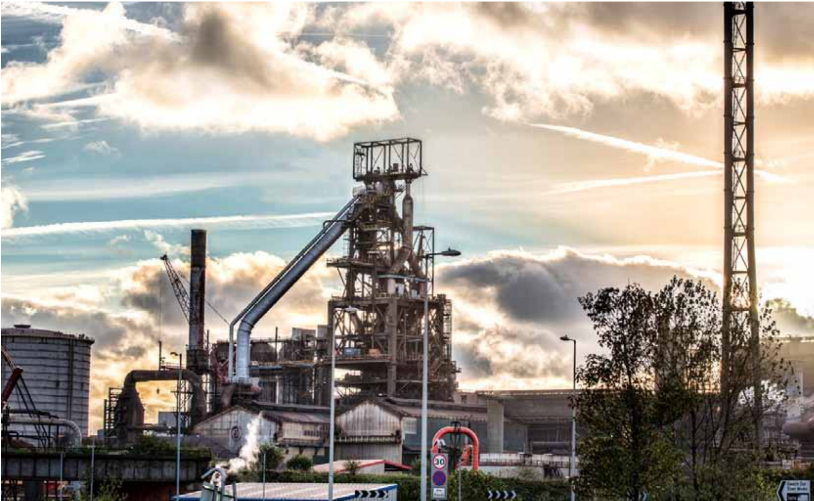
Much of the work that was most critical was completed largely out of sight