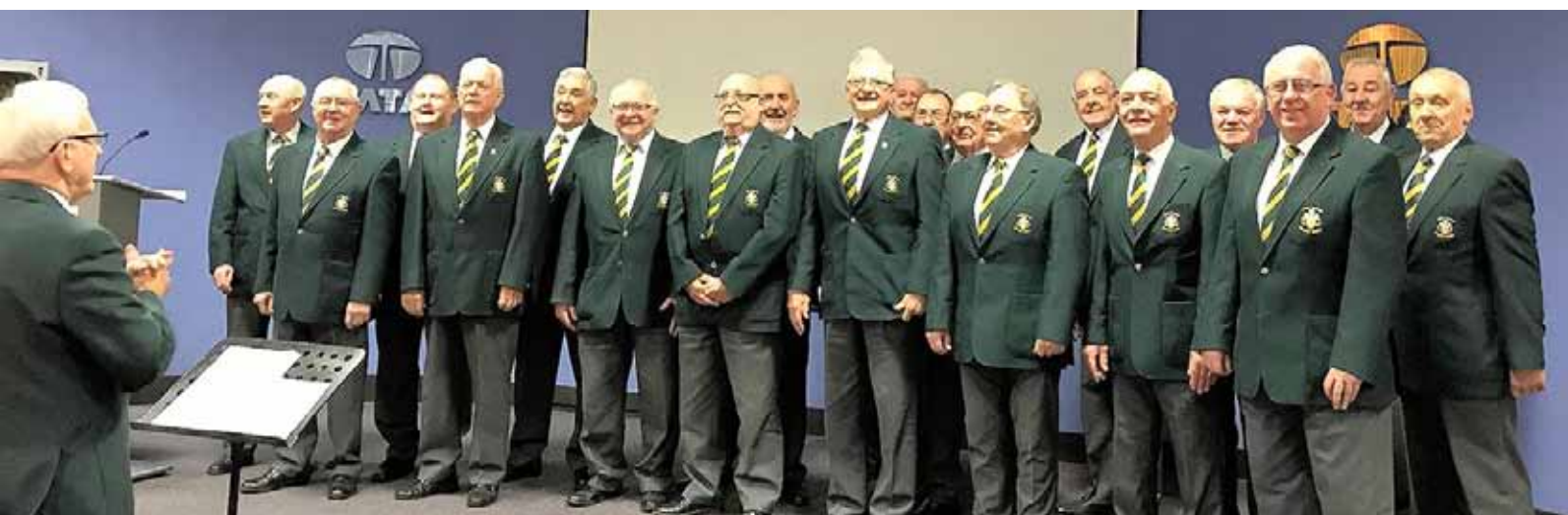
Cymric choir provided wonderful entertainment