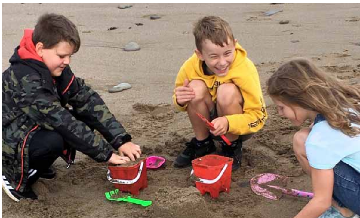
Children enjoying a day at the beach with the Food and Fun club

Port Talbot's strip steels are used in the manufacture of vehicles, cans, buildings, stadia, offshore pipelines, diggers, domestic appliances and a huge variety of engineering applications.