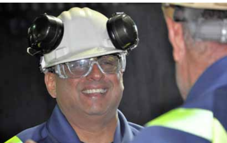
CEO and Managing Director TV Narendran

Tata Steel's global CEO and Managing Director, TV Narendran has again visited Port Talbot to see the progress being made on the Blast Furnace Five life-extension project.