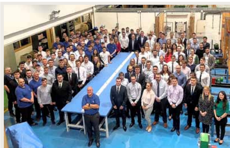
The new Tata Steel recruits