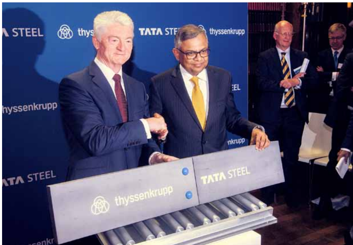
Joint Venture: Natarajan Chandrasekaran, Chairman of Tata Steel and Dr Heinrich Hiesinger, CEO of thyssenkrupp AG