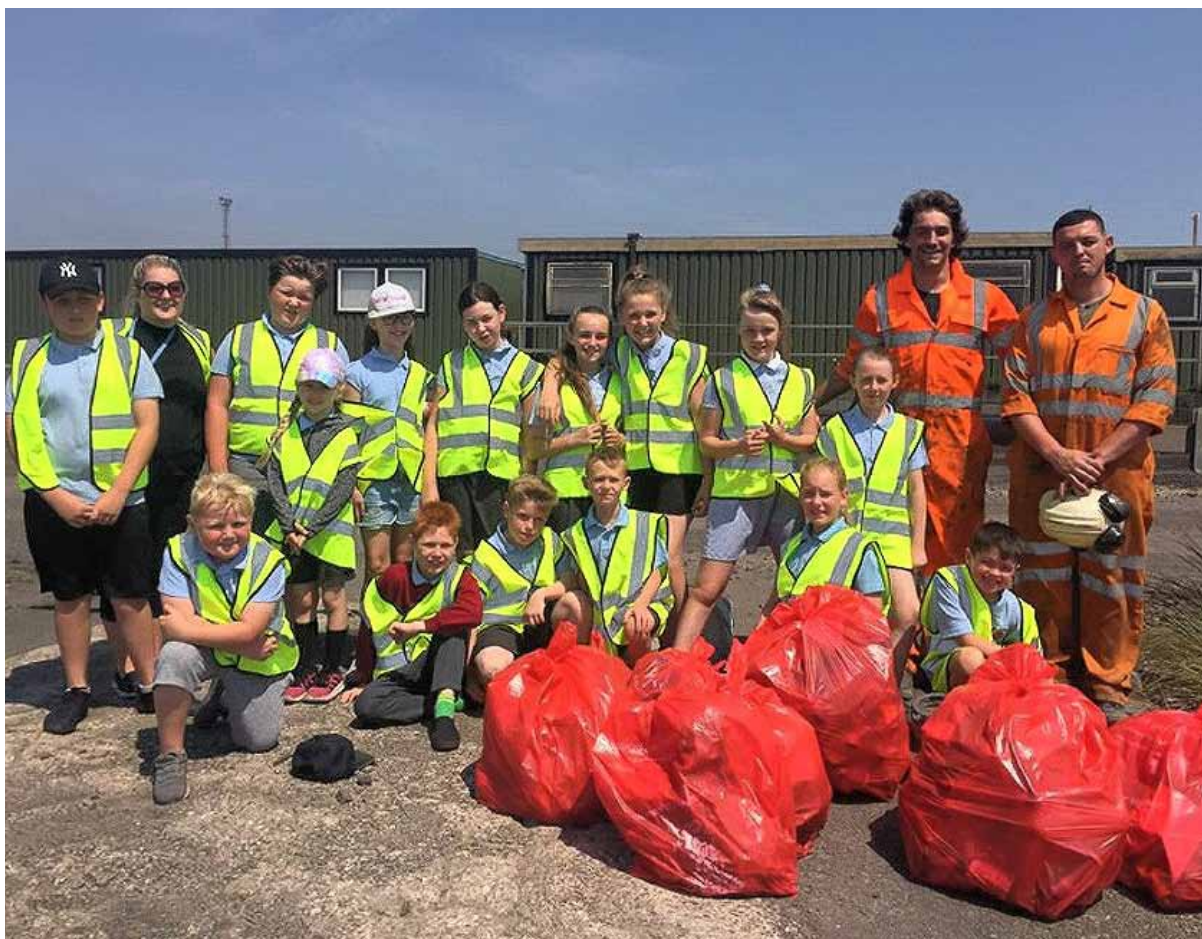
The Eco Rangers collected 15 bags of rubbish on their visit