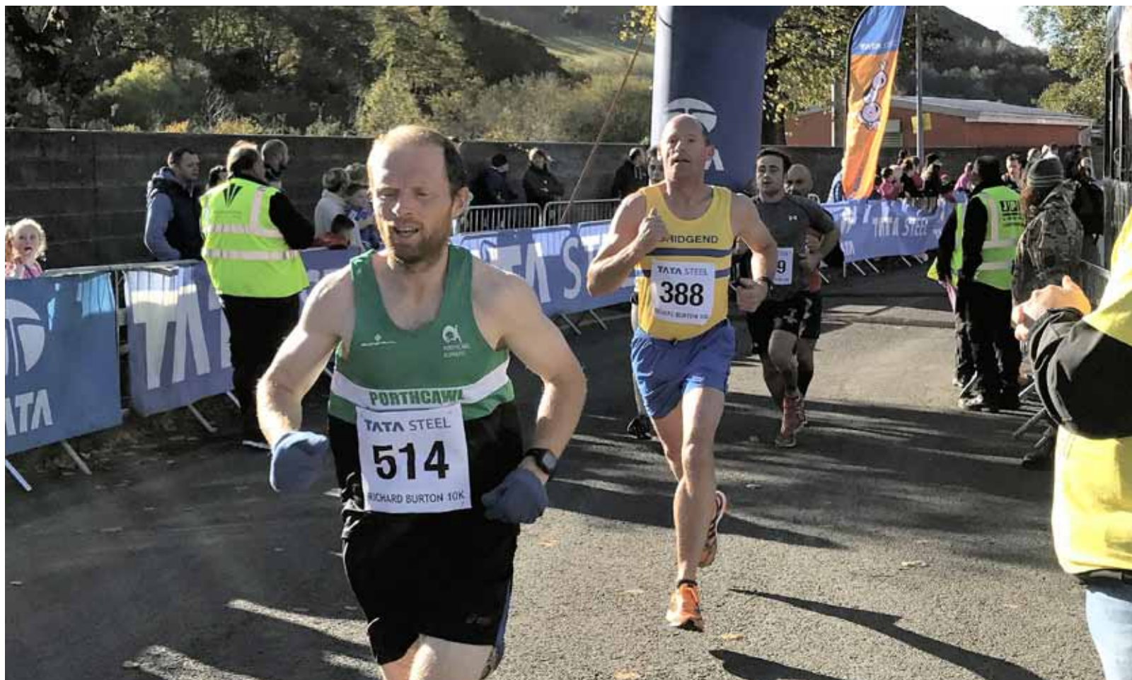
This year's Tata Steel Richard Burton race will take place on Sunday, 4 November

"We are both committed to developing a sustainable manufacturing sector and steel industry in the UK."