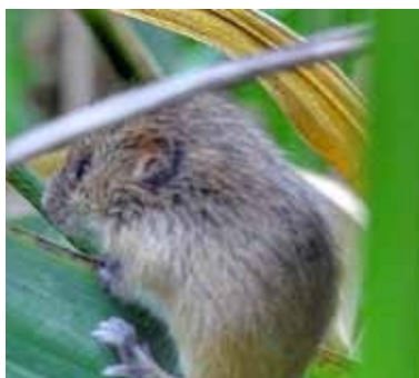
Harvest Mouse found on Margam Moors

"Although our sites are busy places, quiet edges and desirable habitats are often present, sometimes as a direct