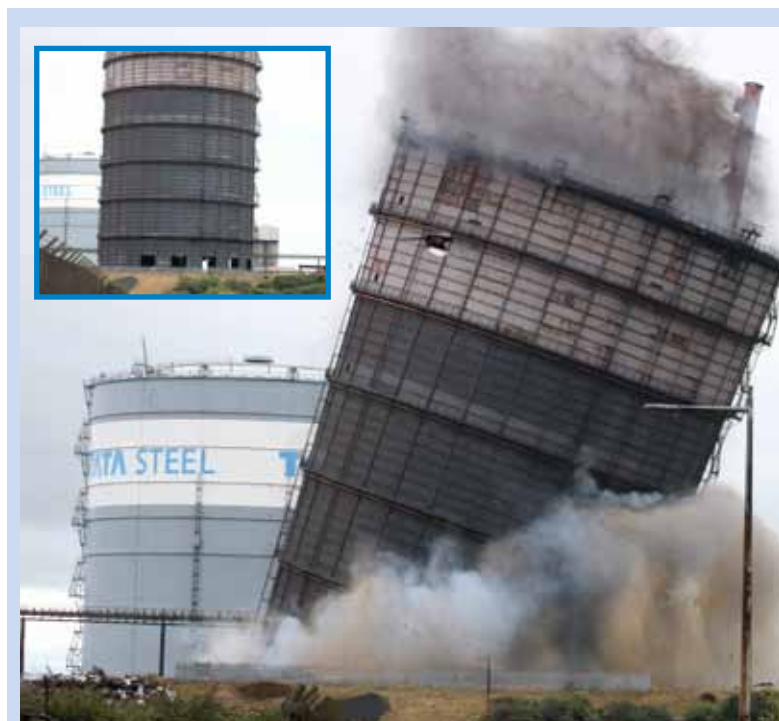
The redundant gas holder is demolished

Only after closing, thyssenkrupp Steel Europe and Tata Steel in Europe will be integrated as one company.