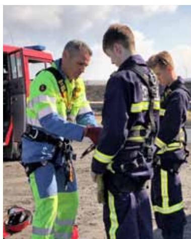
Fire cadets get kitted out for action

"My son was of the right age to become a cadet and I thought it would