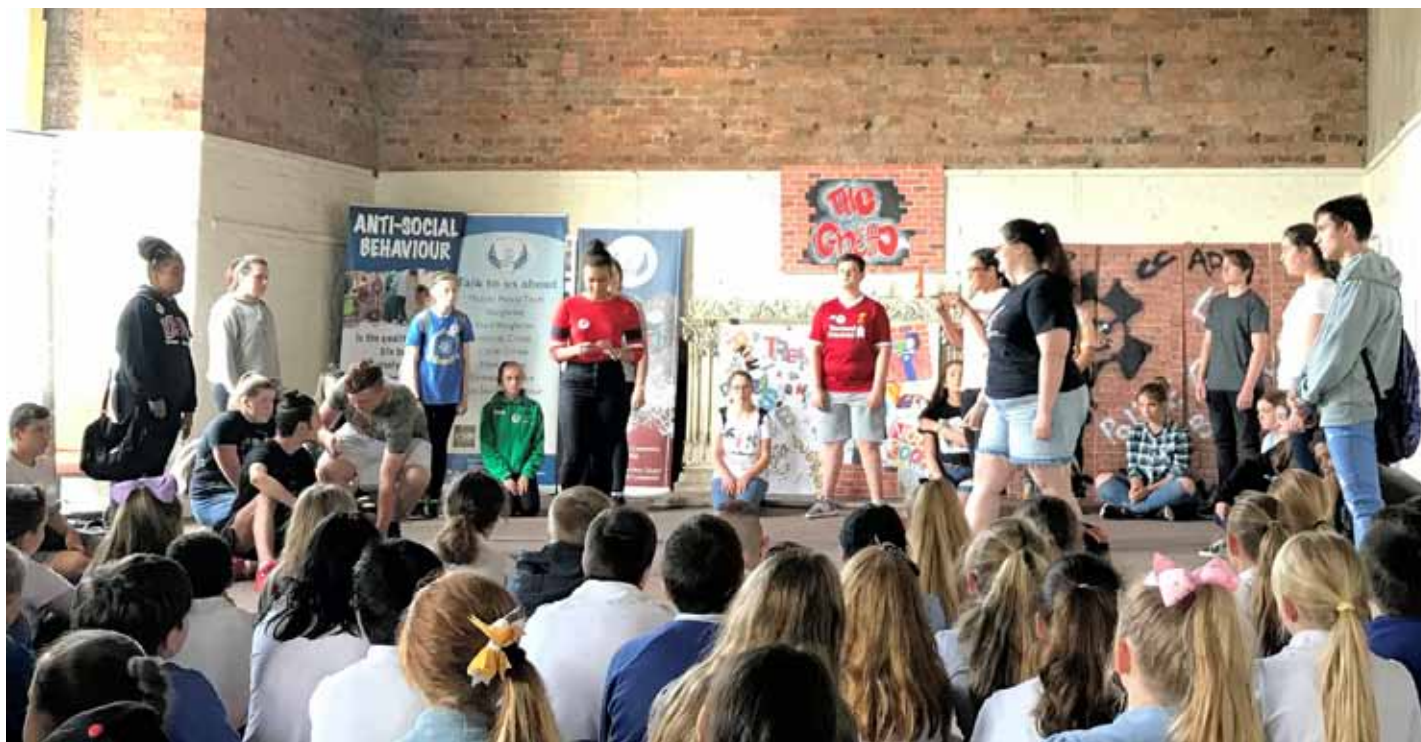
A hard-hitting performance from Dyffryn Comprehensive on cyberbullying at The Crucial Crew event