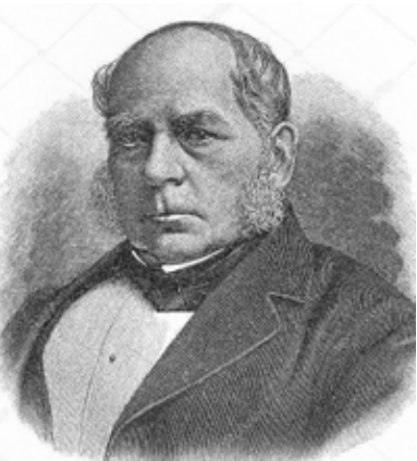
Sir Henry Bessemer, innovator of the first cost-efficient process for mass steel manufacturing

Tata Steel has become the metals industry sponsor of the Bessemer Society, a growing and dynamic group of UK-based start-up manufacturing companies which are commercialising highly innovative new technology applications.