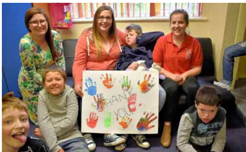
We donate to a number of organisations including this donation to Action for Children's services in Briton Ferry