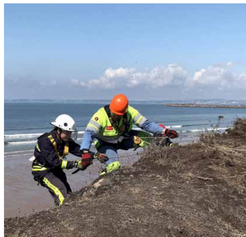
Beach recovery training exercise

Tata Steel has supported the cadets with sponsorship towards the cost of their uniform and the working partnership developed between Mid and West Wales Fire Service and the Tata Steel Fire and Rescue team has given the cadets a great insight into the practical application of skills required to become a firefighter.