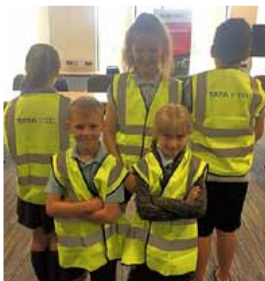
Eco Rangers modelling their high-vis vests!

"I had a great day working in partnership with Tata Steel and Groes Primary School, learning all about the history of our steel industry and making