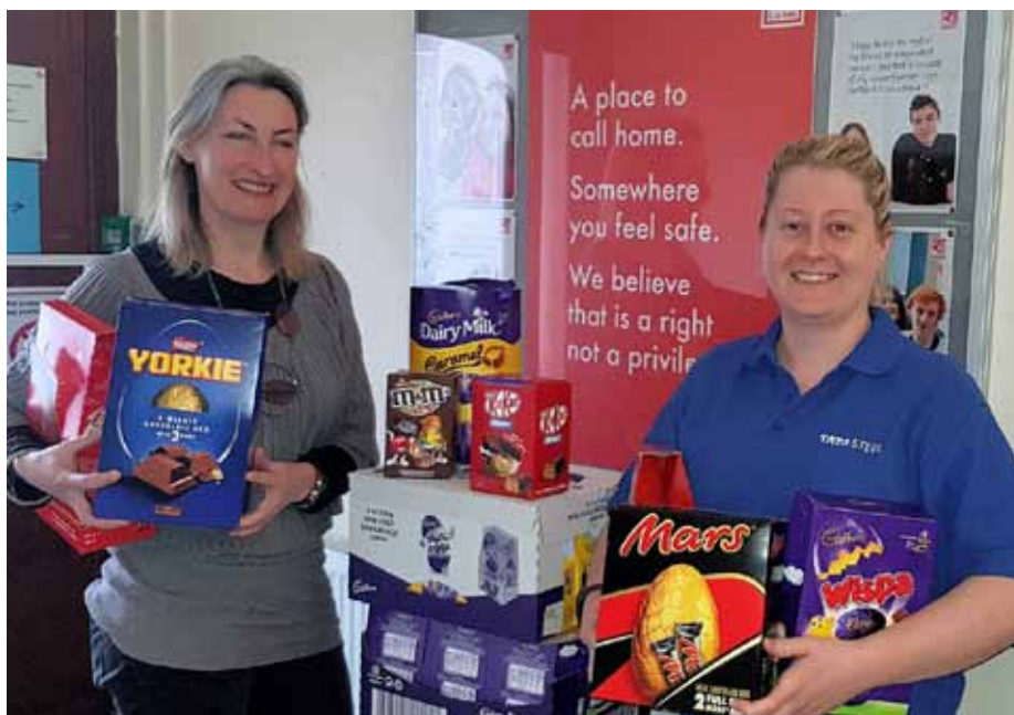
Easter treats were delivered to good causes

Thanks again to everyone who was able to contribute this year and helped make the campaign a success.