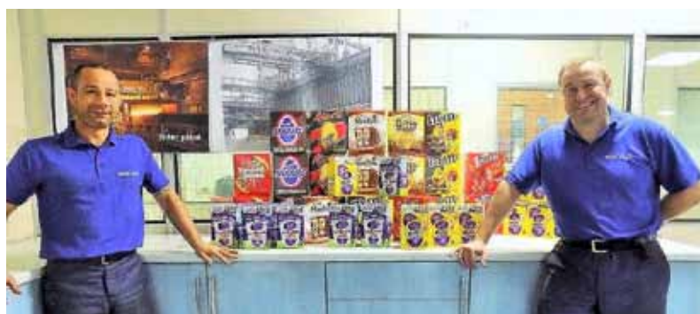
Colleagues have scrambled to donate Easter Eggs