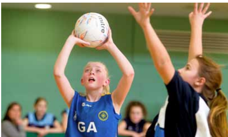
The competition gave local youngsters the chance to get involved in sports

While Tywyn was dominant in most of their games there was stiff competition from Blaenbagan Primary, Ysgol Gynradd Gymraeg Rhosafan and from Briton Ferry Primary, whose players gave 100 per cent until the final whistles.