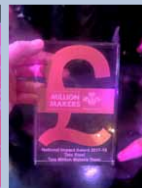
The Million Makers scooped the Impact Award