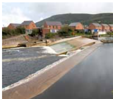
The Green Park Weir

The Green Park Weir improvement project was the result of several years of collaboration between members of the River Afan Water Management Group,