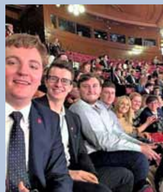
The team wait to hear the results

Team Tata Steel were winners in the Impact Award category, beating competition from other national employers such as Hallmark, Atos and