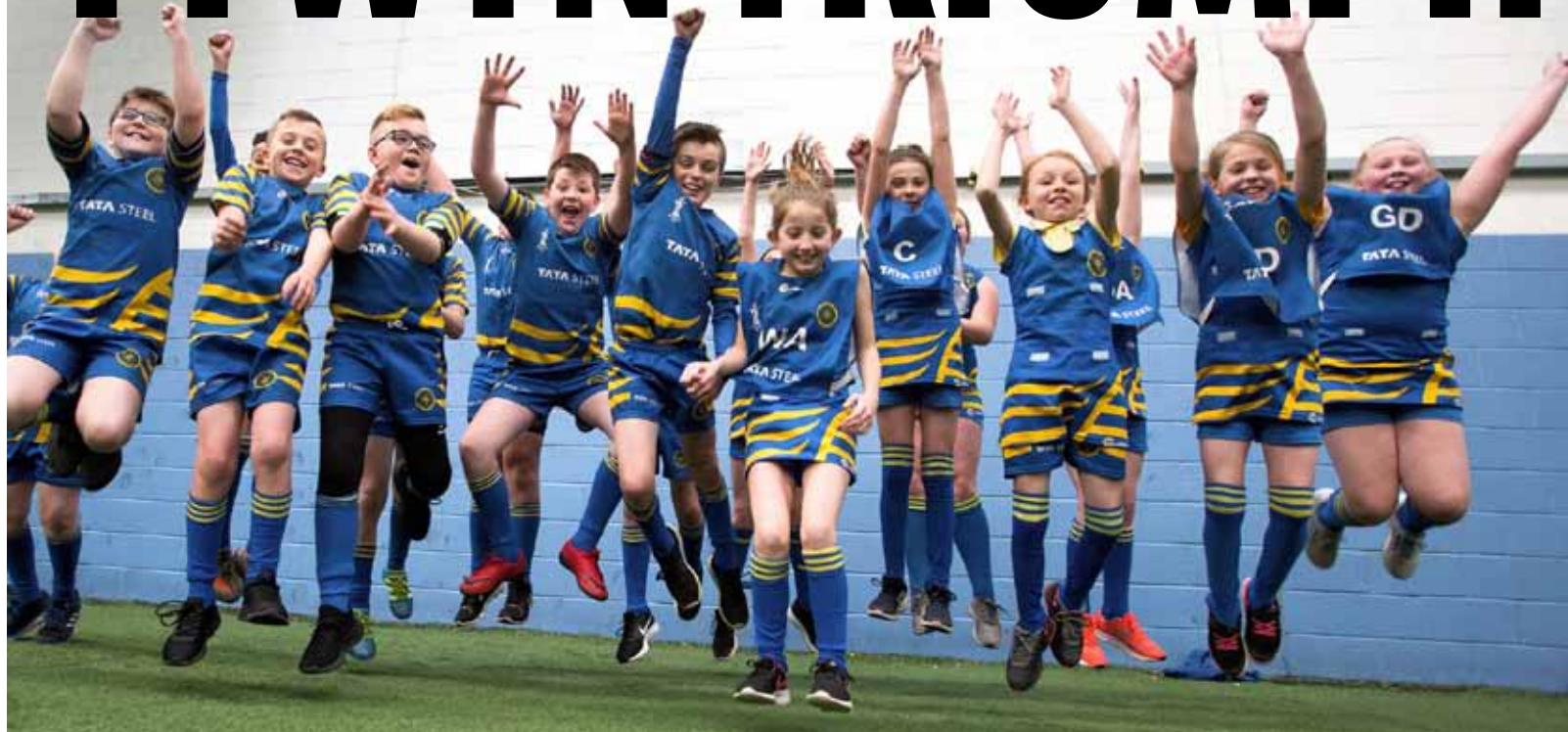
Tywyn were jumping for joy after winning both the netball and rugby competitions in this year's Tata Steel Wizards League

Tywyn Primary girls and boys showed real mettle to once again claim victory in both the netball and rugby competitions at this year's Tata Steel Wizards League final.