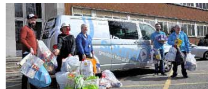
The team from The Wave dropped in to help distribute the eggs