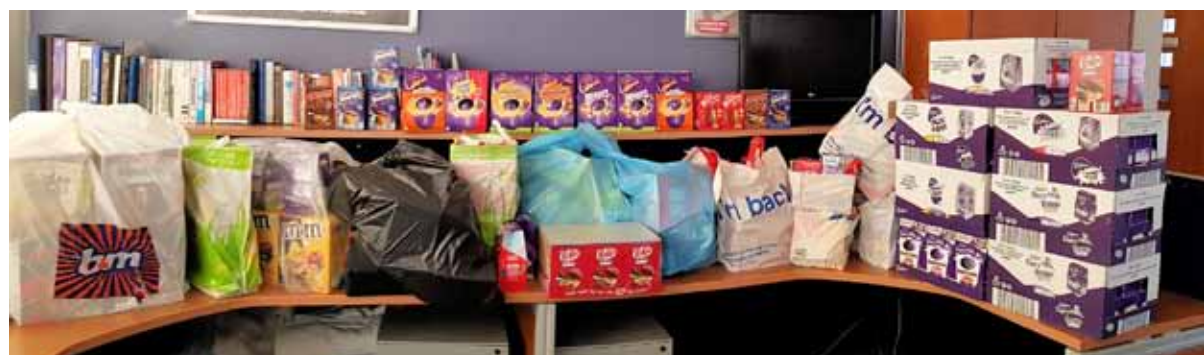
An egg-straordinary amount of chocolate delights were donated