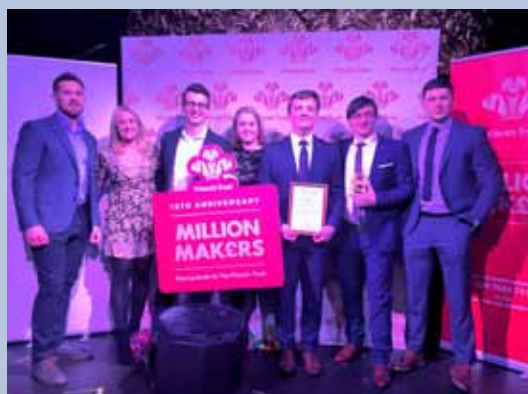
Tata Steel's Million Makers celebrate their success